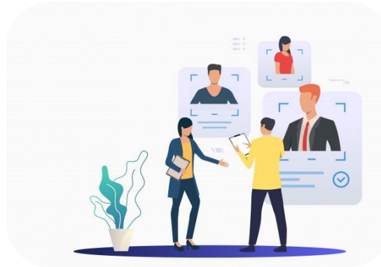
Role play interview